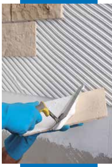
Spreading adhesive on the back of ornamental units