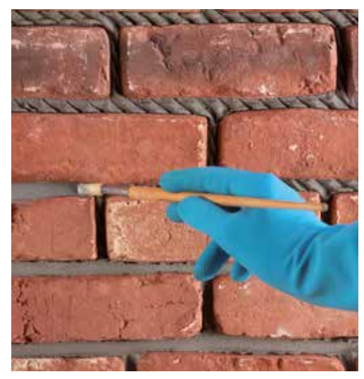
Smoothing the joints with a damp brush