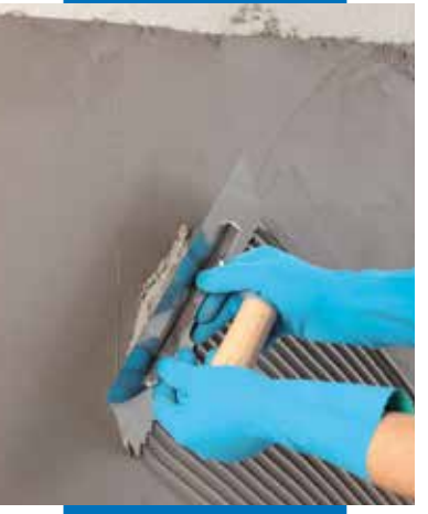
Spreading cement grey Fix & Grout Brick diagonally with a notched trowel