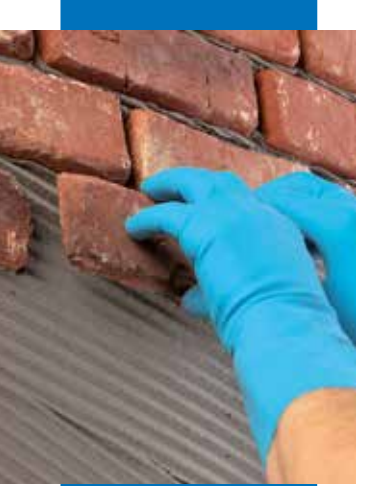
Laying terracotta slips