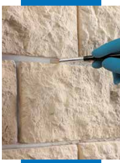
Smoothing the joints with a damp brush