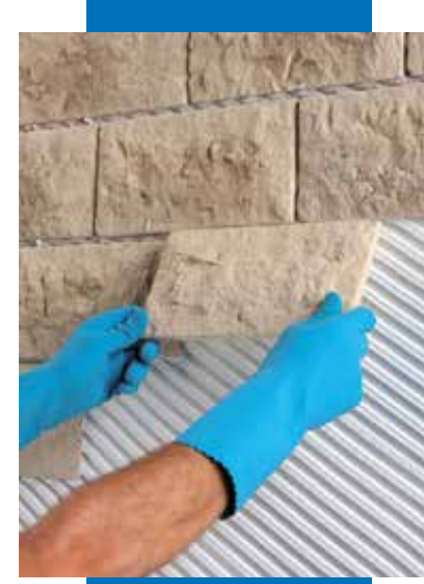
An example of laying ornamental lightweight cementitious composite slips externally