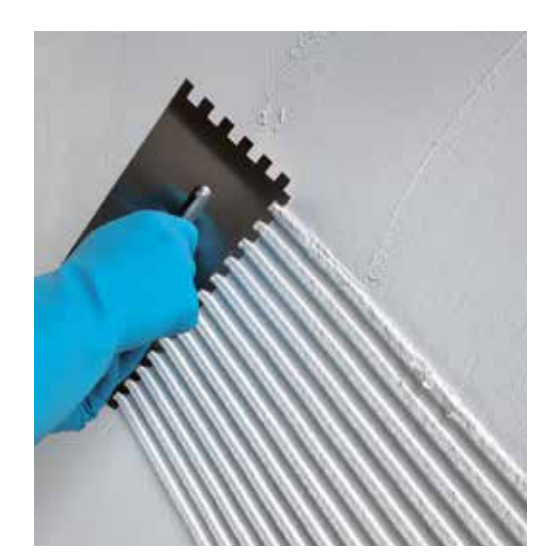
Spreading white Fix & Grout Brick diagonally with a No. 10 notched trowel

For further and complete information about the safe use of our product please refer to the latest version of our Material Safety Data Sheet.