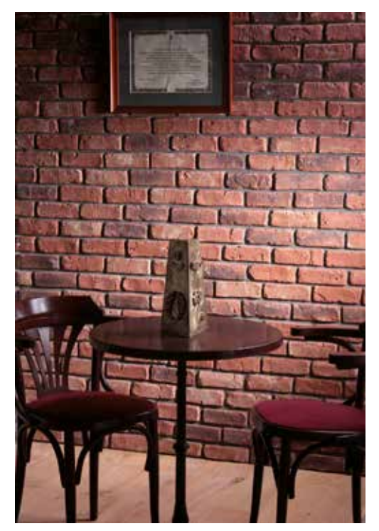
An example of laying terracotta brick slips outside