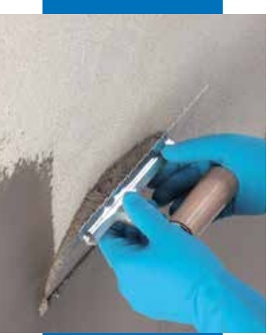
Spreading cement grey Fix & Grout Brick to a feather edge on the substrate