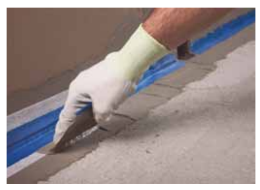
9. Spread on a second layer of the specified MAPEI waterproofing product to completely cover the edges of the tape so they are sandwiched between the two layers of the cementitious mortar