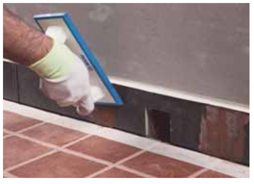
12. Bond on the skirting boards and grout the vertical joints