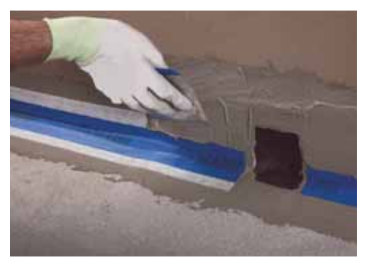
8. Lay on Mapeband by pressing along the sides, making sure there are no creases or air bubbles