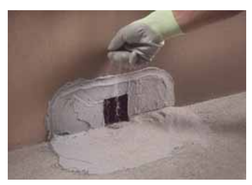
5. Smooth over with a flat trowel and, while the product is still fresh, sprinkle on a layer of 0.5 spheroid quartz to form a rough layer to help the specified MAPEI waterproofing product form a good bond

2. Spread on an even layer of Adesilex PG4 two-component, thixotropic epoxy adhesive with a smooth spatula on the clean, dry substrate