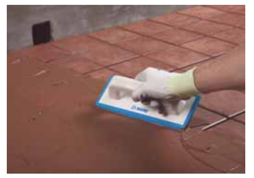
11. After applying the MAPEI waterproofing product according to the relative Technical Data Sheet, bond on the floor coating and grout the joints