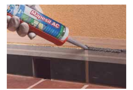
13. Seal with Mapesil AC in correspondence with the skirting board-wall fillet joint