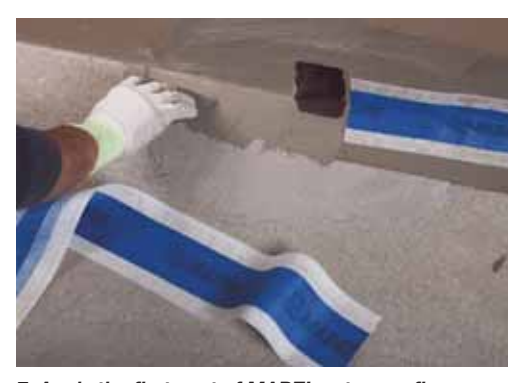
7. Apply the first coat of MAPEI waterproofing product on the clean, dry fillet between the horizontal and vertical surfaces

4. Spread on a second coat of Adesilex PG4 fresh on fresh to completely cover Drain Front