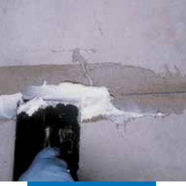
Grouting a joint with Primer MF admixed with Additix PE