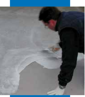
Primer MF thickened with Additix PE